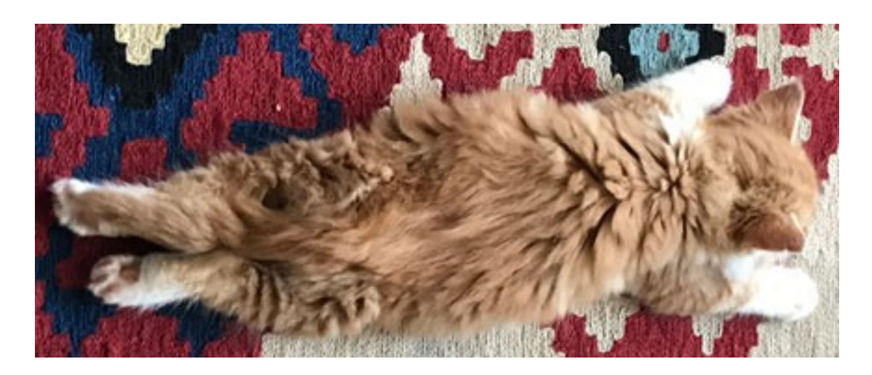
As He Moves On

I'm pretty sure Tommy wants to be an only cat. He dislikes having to share any attention and he's so in love with his people. He's never exhibited any interest in what's outdoors, so it should be easy for him to be a total house cat. I think Tommy could adjust to children and possibly dogs. Tommy craves attention.